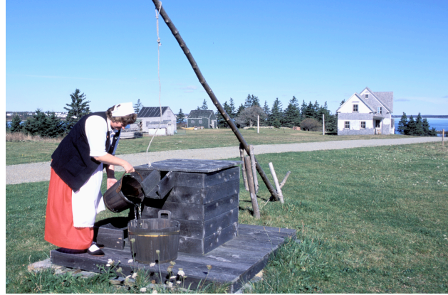
Historical Acadian Village of Nova Scotia