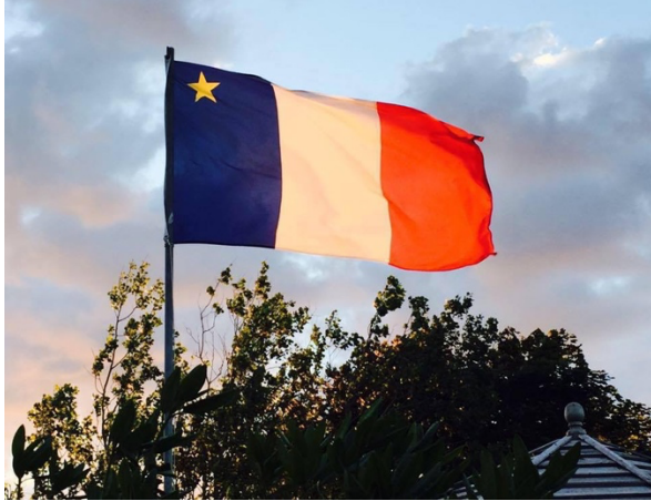
The Acadian Flag, adopted in 1884