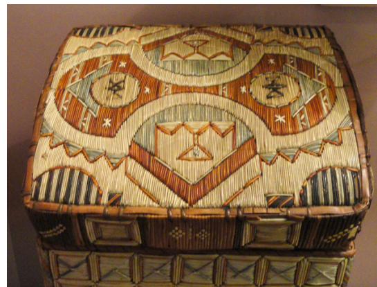
Birch box ornated with stained porcupine quills – mi'kmaq craft

In today's world, the term Acadie is typically used to refer to all Maritime provinces of Canada.