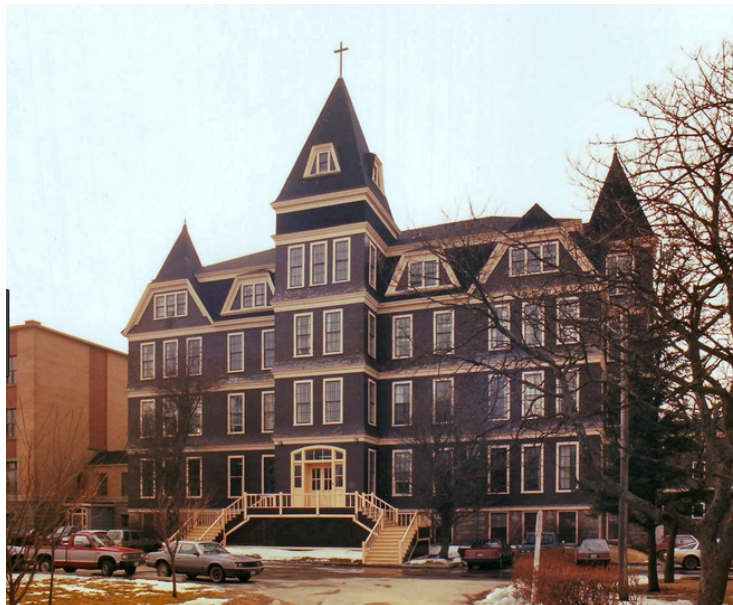
Founded in 1890, Université Sainte-Anne is located in Pointe-de-l'Église.

As an example, at the education level, an act was passed in 1864 forbidding the instruction in French in Nova Scotia. However, the presence of Collège Sainte-Anne in Pointe-de-l'Église, later to become Université Sainte-Anne, considerably helped with the academic curriculum, the training of teachers and the availabilities of French material in the schools of Clare and Argyle.