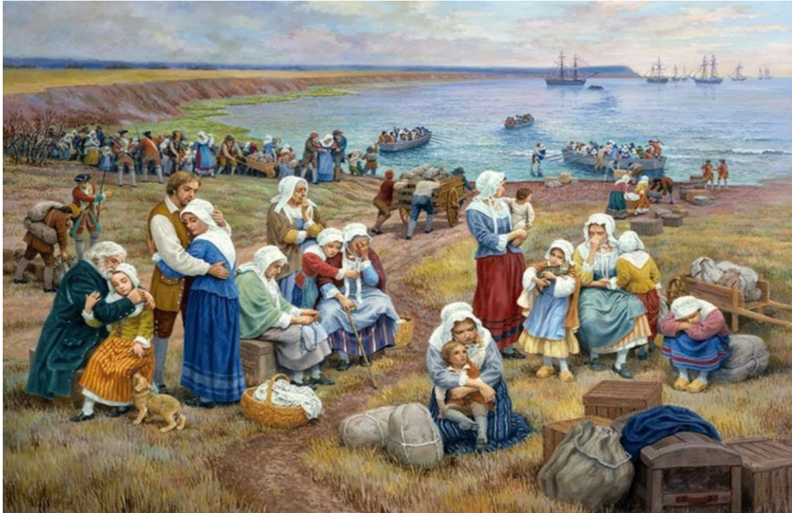
The Deportation of the Acadians: painting by Claude Picard